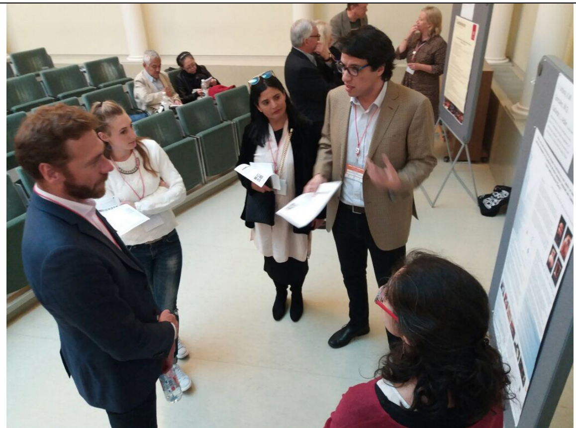
Legend: The authors presenting their research to the audience.