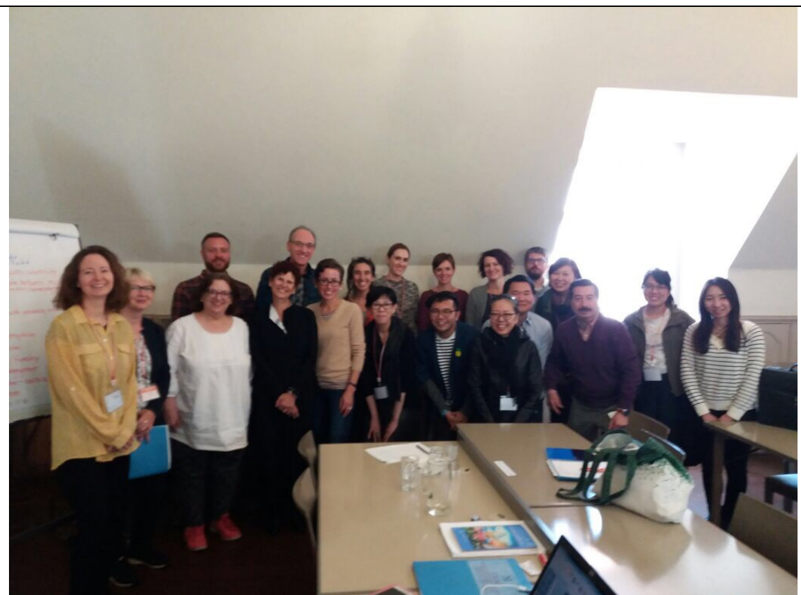
Legend: Participation of the Chilean team in the Conference.