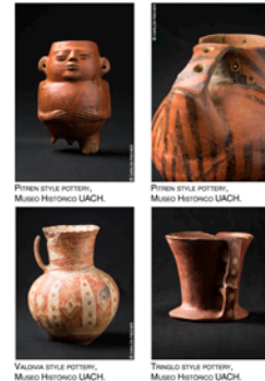
PITRÉN STYLE POTTERY, MUSEO HISTÓRICO UACH.

The heritage values of those ceramic collections contrast with the degree of legal protection that they possess in the legislation in force in Chile (Law 17.288 of National Monuments). For this reason, there is an urgent need to promote and coordinate basic and collaborative work among the different museums of the region.